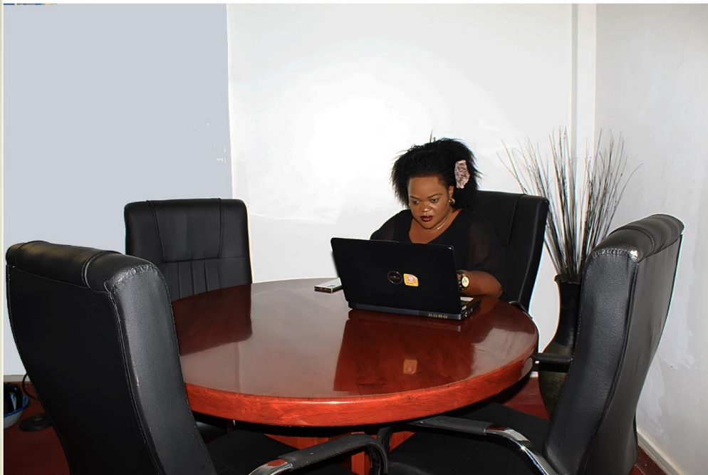
The office has a Mini Conference Facility