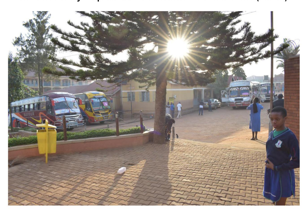
Some of the buses used for the Primary 6 class tours to Eastern Uganda