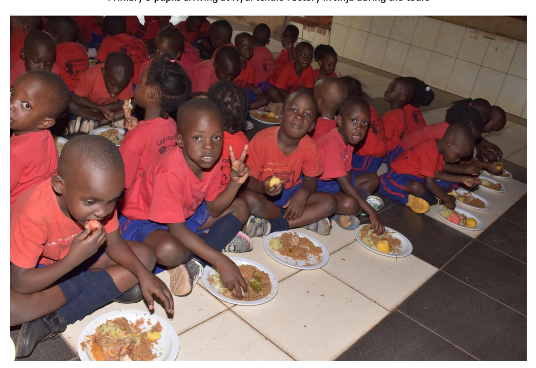
Nursery pupils of Mother Majeri Nursery School have a heartily meal amidst the plays they had at the park.