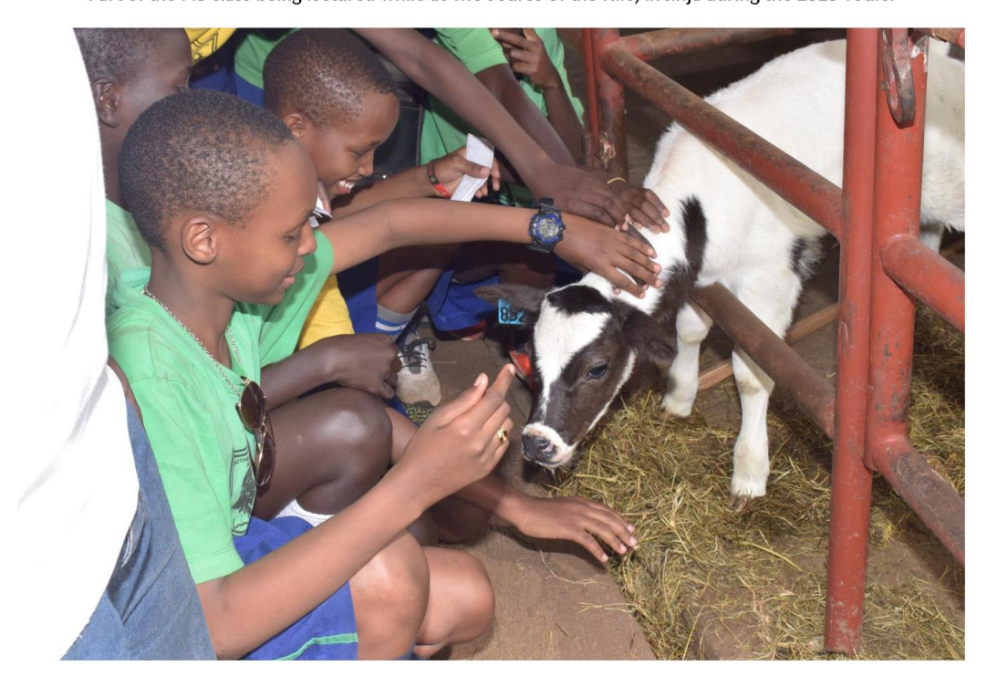
P.6 pupils interact with a calf at Kakira Stock farm during the tours.