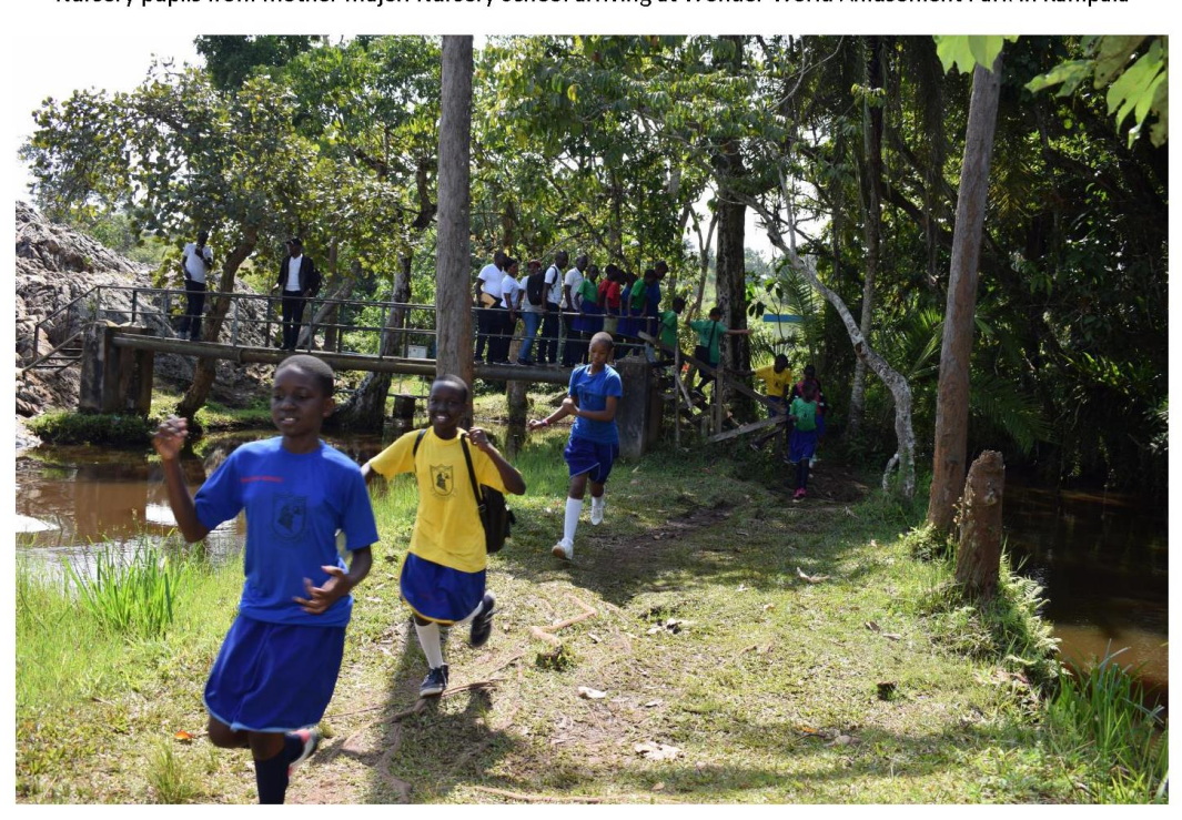
Primary 6 pupils arriving at Ssezibwe water falls