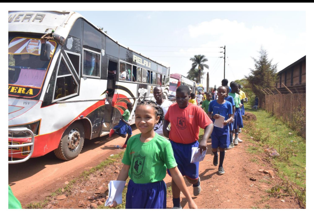
Primary 5 pupils arriving at Nytil textile Factory in Jinja during the tours