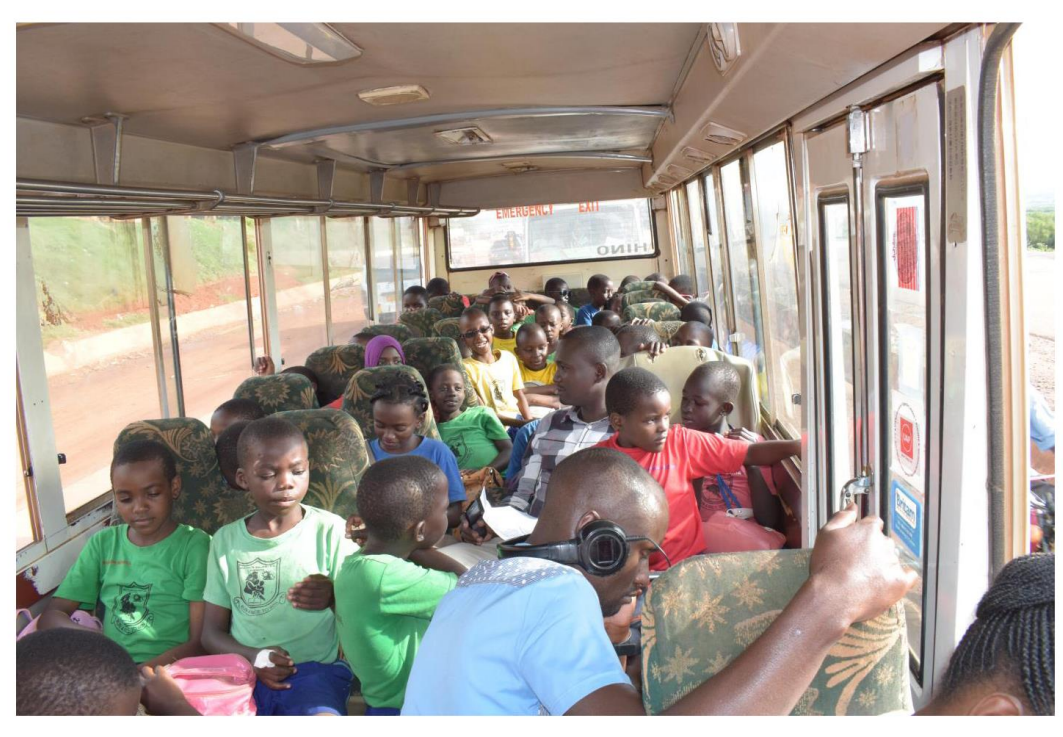
P.4 Efficient stream returning from the tours to Entebbe Zoo in their school bus