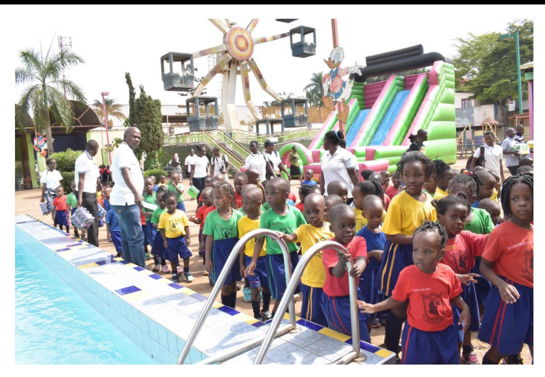
Nursery pupils from Mother Majeri Nursery School arriving at Wonder World Amusement Park in Kampala