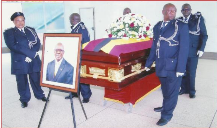
The Body Of Hon. Stanley Omwonya Arrives At Parliament