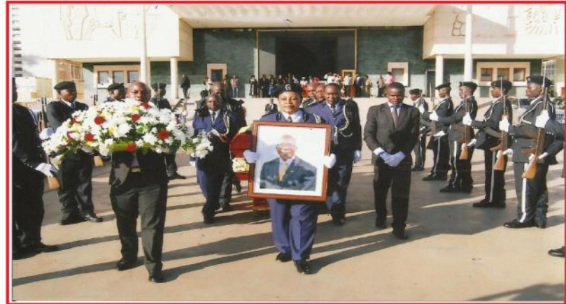
The Body Of Hon. Stanley Omwonya Leaves Parliament