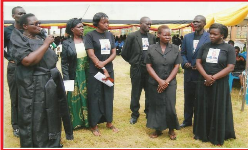
Family Members at Burial