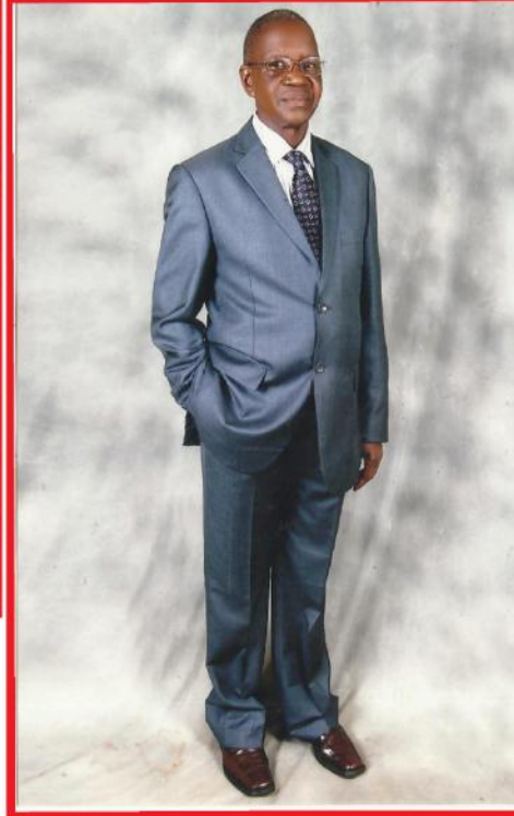
HON. Stanley Omwonya in kampala city 2014