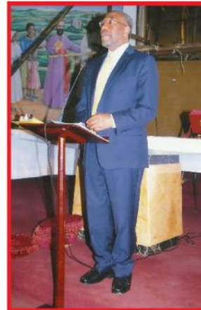
The Prime Minister Of Uganda, Rt Hon. Dr. Ruhakana Rugunda Address Mourners At Our Lady Of Africa Church - Mbuya