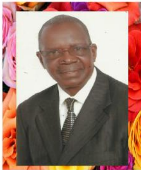
Hon. Stanley Omwonya Ever humble pic 2012