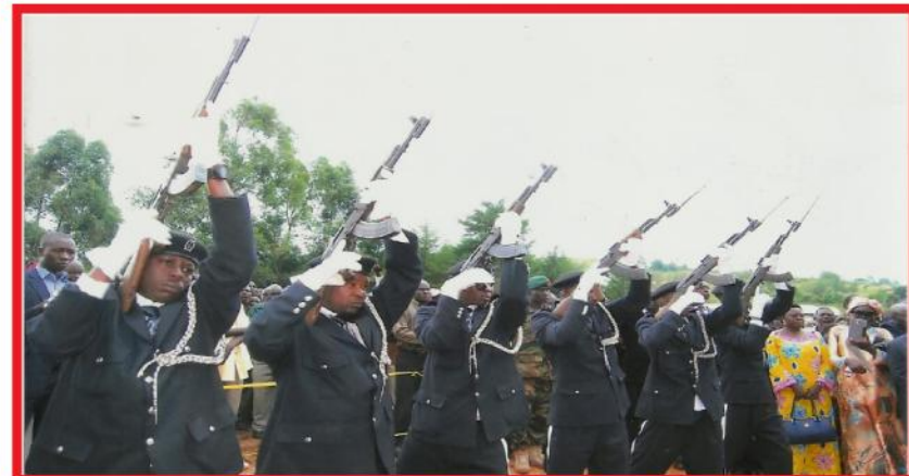
Gun Salute in Honour of His Praise Worthy Life