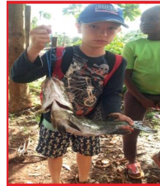
A pupil of Kampala Academy holds a fish (Nile perch) during scouts camp in Jinja source of the Nile