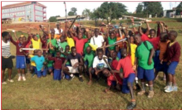
VIBRANT: The school hockey team photographed after a good win.