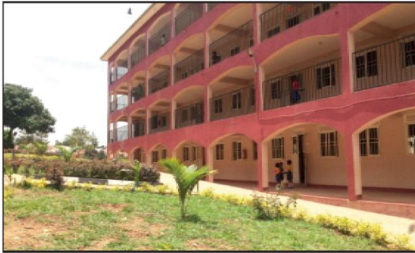
Spacious: Above is one of newly constructed school facilities 2016