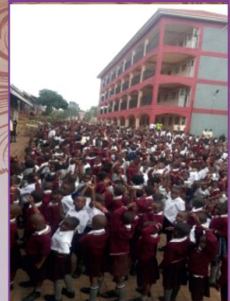
Pupils photographed during one of the assemblies held every Monday.