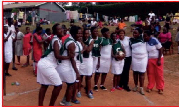
HOLISTIC DEVELOPMENT: Teachers of Kampala Academy keep fit. Here the teachers were for a netball friendly.