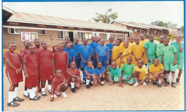
Kampala academy pupils pose for a photo graph.