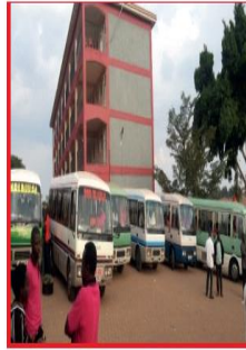
SCHOOL CULTURE: Study tour(s) has steadily become part of the school culture. Above are hired vehicles ready to facilitate the travel and tour of the school community.