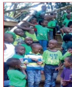
STUDY TOUR: Nursery pupils visit the WILD Life Centre in Entebbe 2017