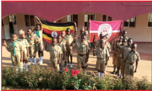
Scouting Activities is highly promoted at Kampala Academy