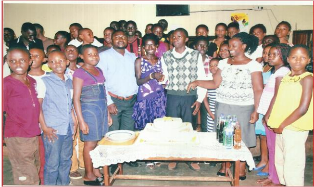
Celebrations: pupils of Kampala Academy pose for a Photograph with display of a sweet Ugandan cake