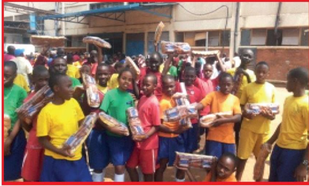
STUDY TOUR: Kampala Academy pupils visit Tip Top bakery in Jinja Municipality – Uganda.