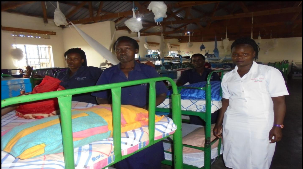
MATRONS WITH THE SCHOOL NURSE INSIDE ONE OF THE DORMITORIES