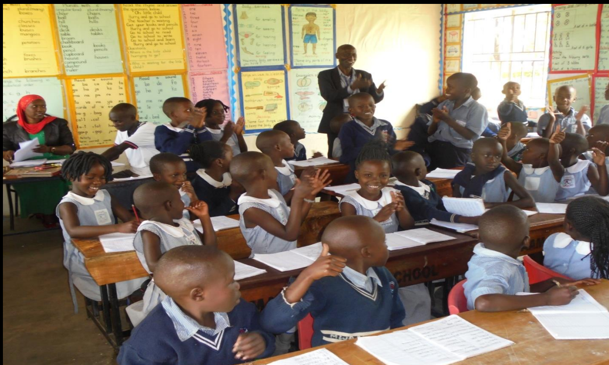
OUCHA PAYS A VISIT TO P.2 B CLASS ON 5 TH JUNE 2018