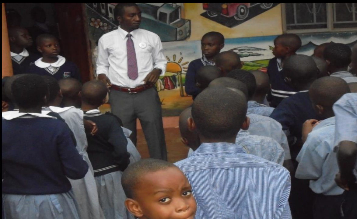
A TEACHER INSTRUCTING CHILDREN DURING A MORNING PARADE