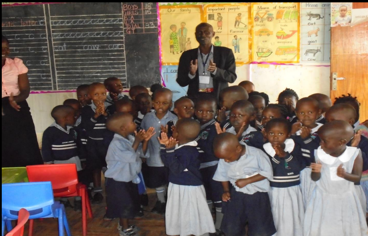
OUCHA PAYS A VISIT TO MIDDLE CLASS