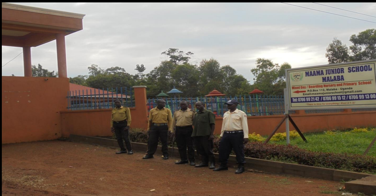
SECURITY GUARDS AT THE ENTRANCE OF THE SCHOOL