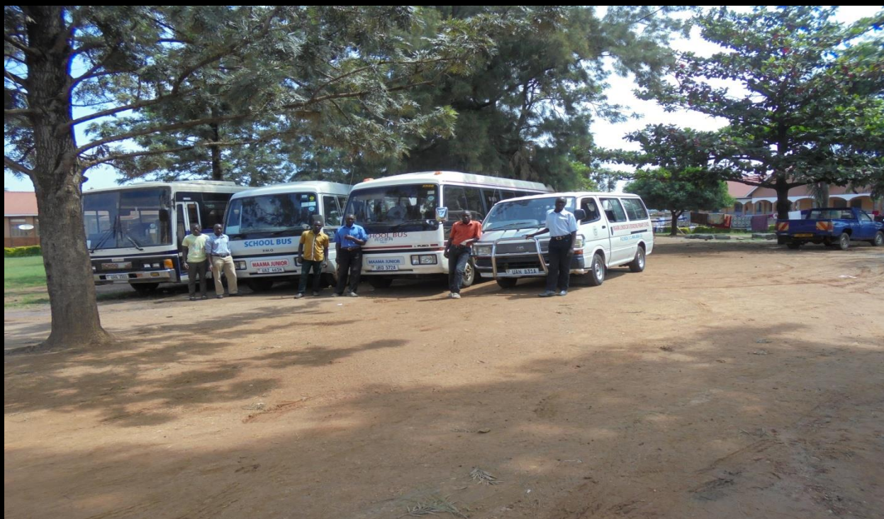
DRIVERS INFRONT OF THE SCHOOL BUSES