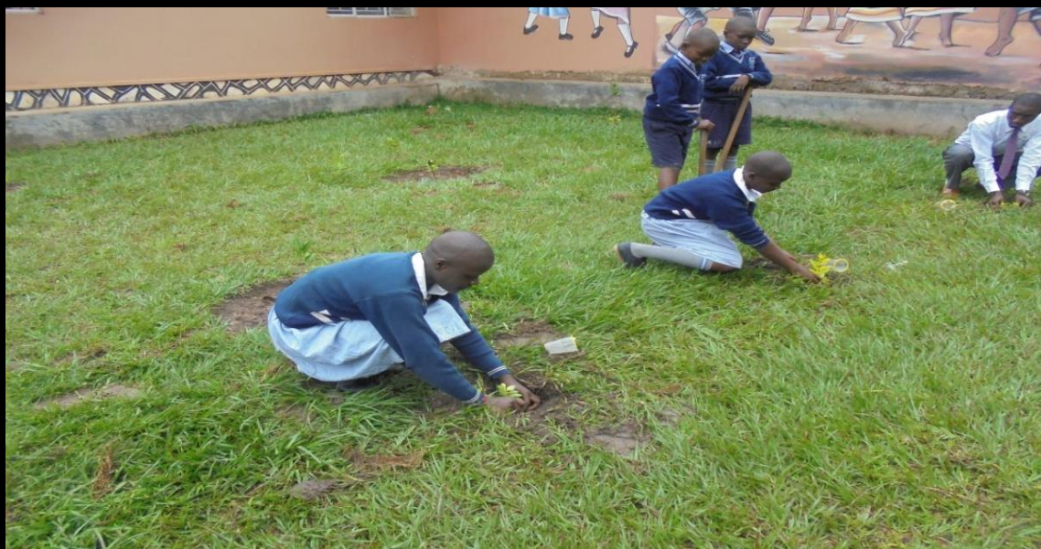
TREE PLANTING A CONTINUOUS ACTIVITY AT THE SCHOOL