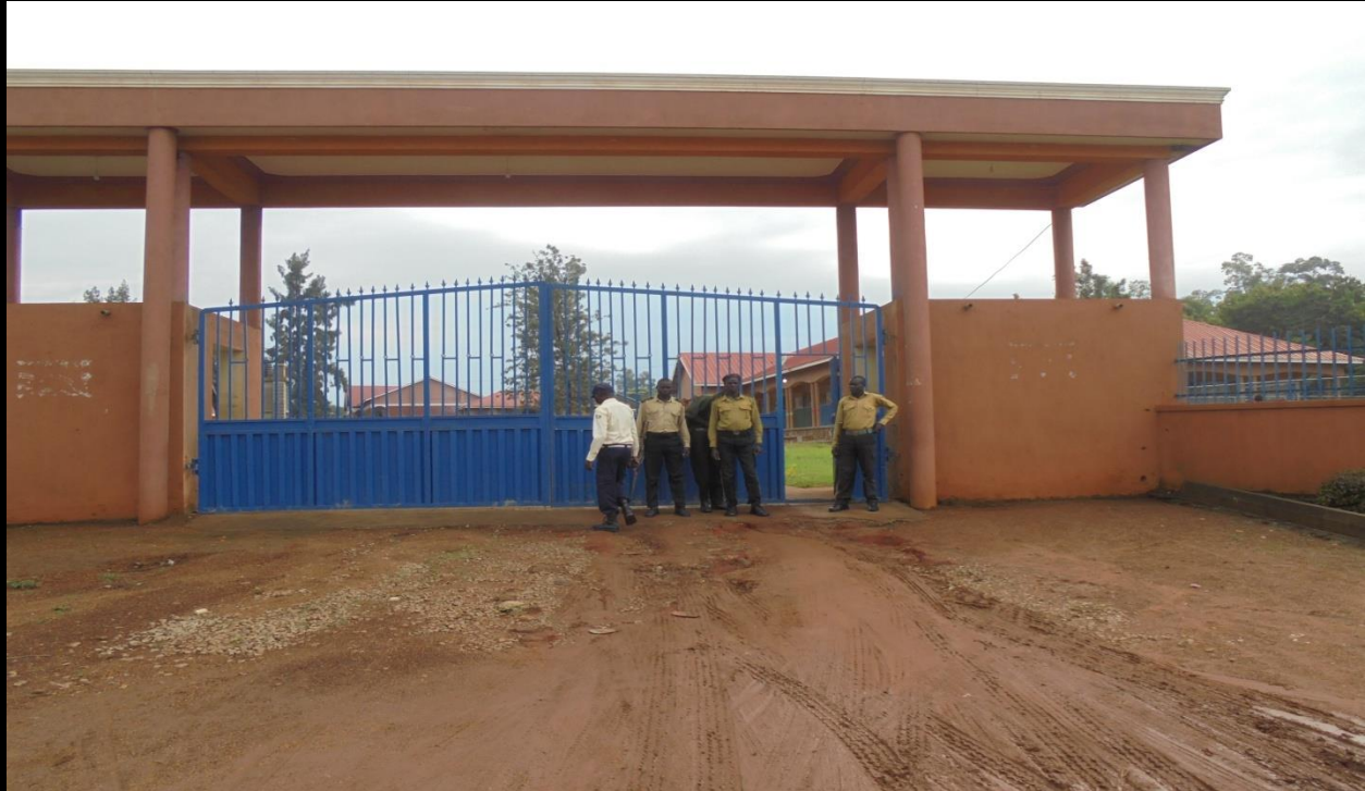
MAIN ENTRANCE TO THE SCHOOL