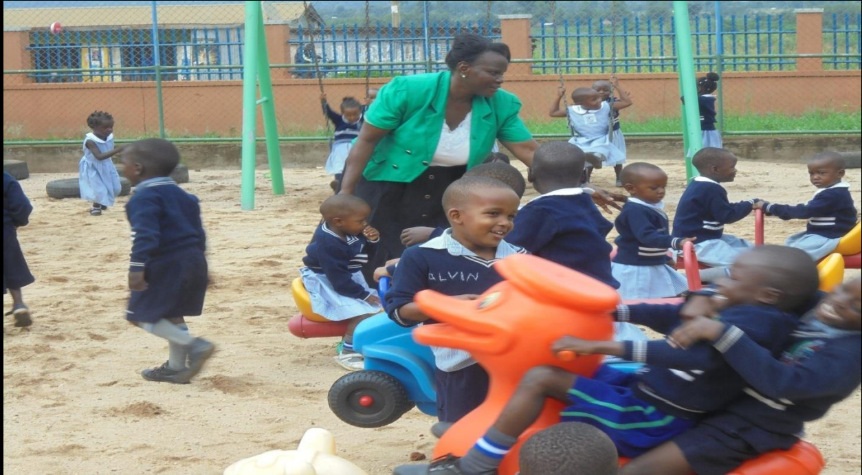
NURSERY SCHOOL CHILDREN AT THE PLAY STATION