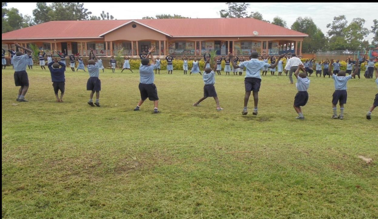
CHILDREN BEING GUIDED BY THE TEACHER DURING PHYSICAL EDUCATION