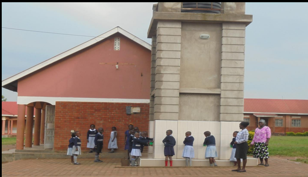
CHILDREN GETTING DRINKING WATER FROM WATER PURIFIER