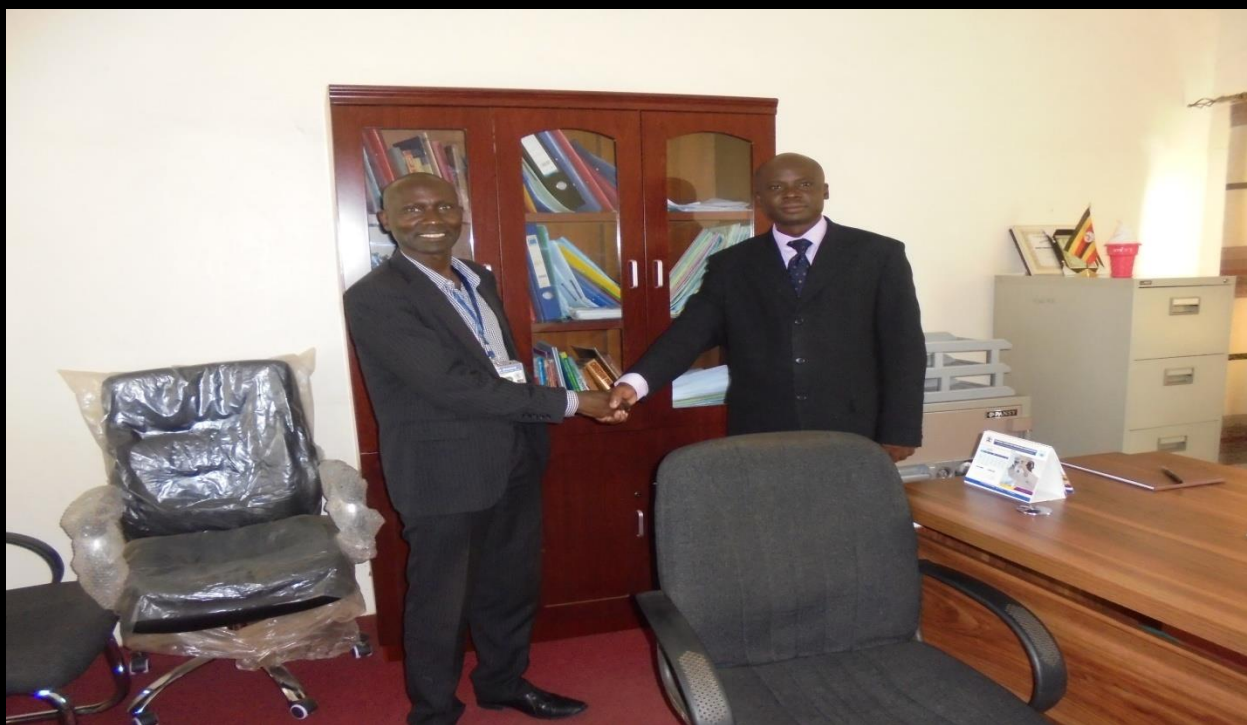
OOUCHA VISITS THE HEADTEACHER'S OFFICE ON 5 TH JUNE 2018