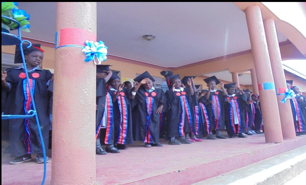
TOP CLASS GRADUATION ON 25 TH NOVEMBER 2017