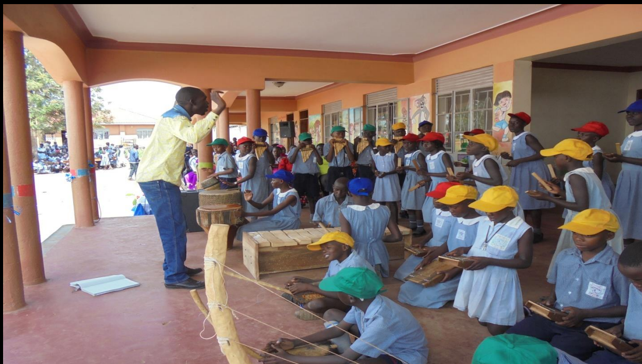
SCHOOL CHOIR DURING THE GRADUATION OF TOP CLASS 2017