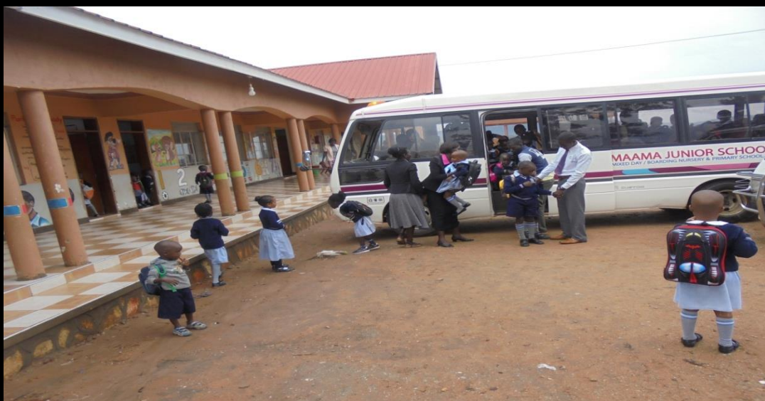
PUPILS ARRIVE AT SCHOOL ON 5TH JUNE 2018