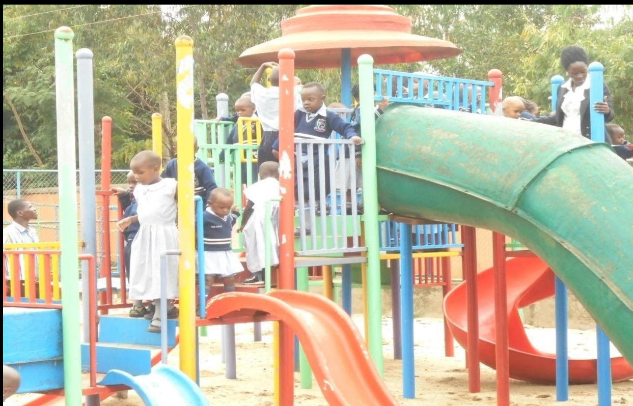
NURSERY SCHOOL CHILDREN AT THE PLAY STATION