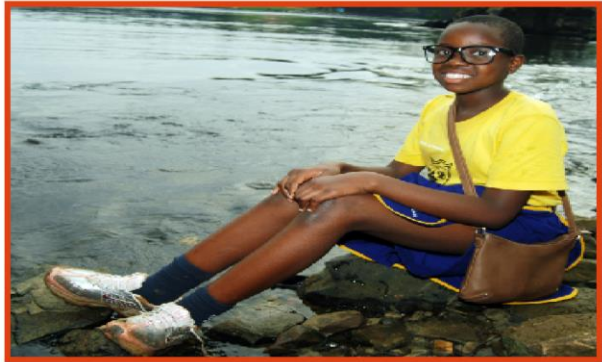
Mother Majeri pupil posing at the source of River Nile - Jinja.