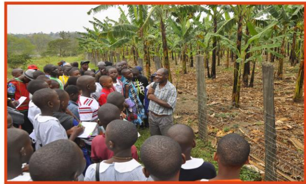
Children learning at Mbarara stock farm (NARO)