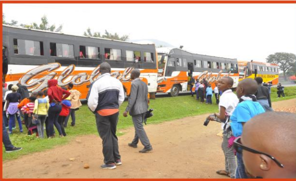
The departure of Mother Majeri pupils from Lake Katwe in Kasese District Uganda