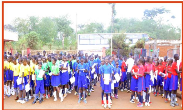
Pupils ready to take notes at the Nyanza Textile Industries in Jinja