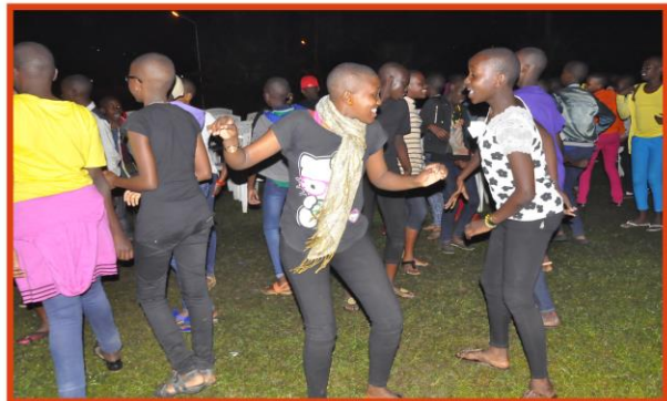
Children take time to dance off the journey fatigue at Mbarara lakeview Hotel.