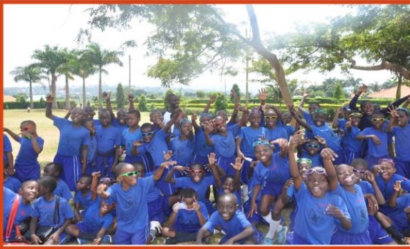
Mother Majeri pupils pose for a photograph in the Gardens at kavumba Recreation Centre in Wakiso District - Uganda.