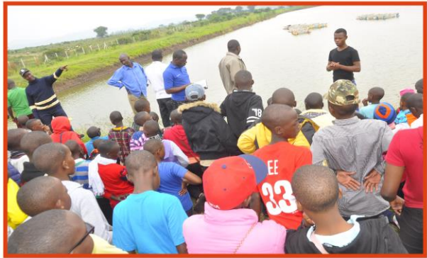
A brief study at Mobuku dam