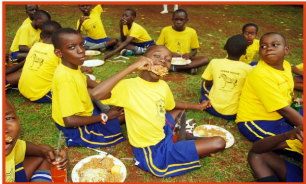
Time for meals; pupils served with delicious Ugandan Chicken.