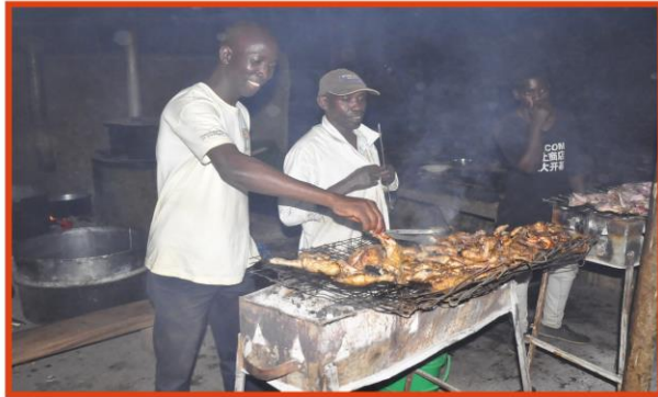
Sweet Ugandan chicken - Mother Majeri pupils were served hot chicken.