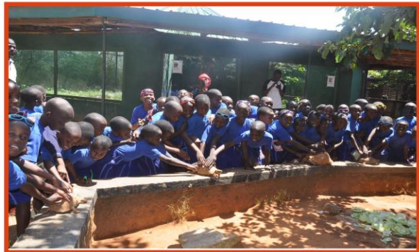
Hands On - Pupils take a closer look at tortoise kept at Kavumba Recreation Centre in Wakiso District.