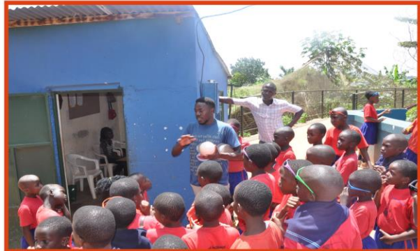
Mother Majeri pupils gather to take a closer look at the egg of an Ostrich at kavumba Recreation Centre in Wakiso District - Uganda