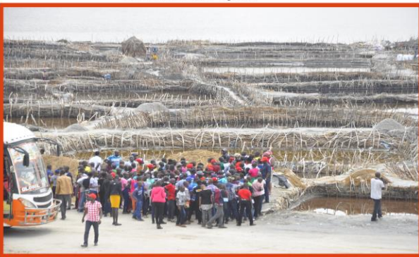
A close view of the Salt mining plots at Lake Katwe.