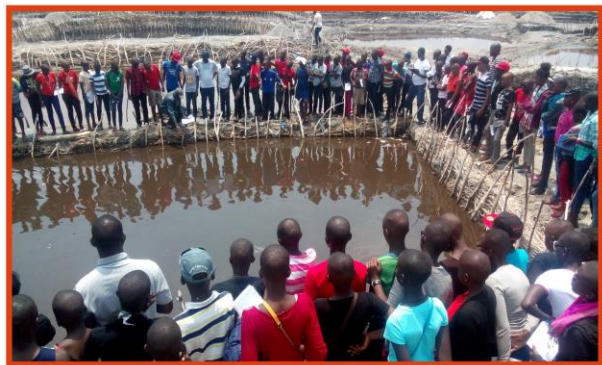
Inquisitive - Children insist on learning more about salt mining