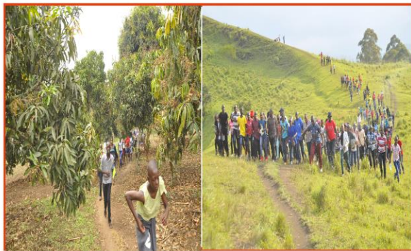
Left: children walk through a vast mango plantation Right: children prepare for mountain trekking.