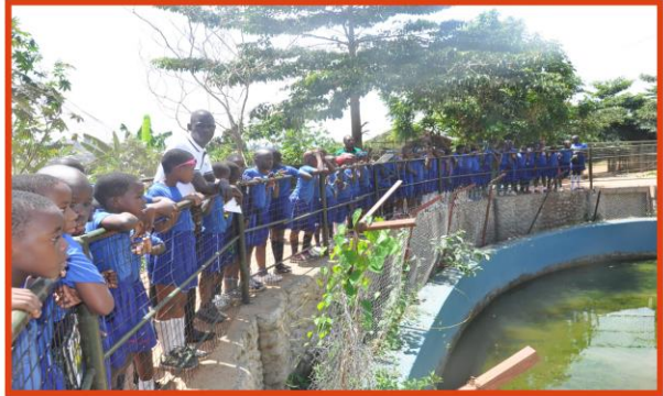
Mother Majeri pupils gather to watch a playful crocodile at kavumba Recreation Centre in Wakiso District - Uganda.