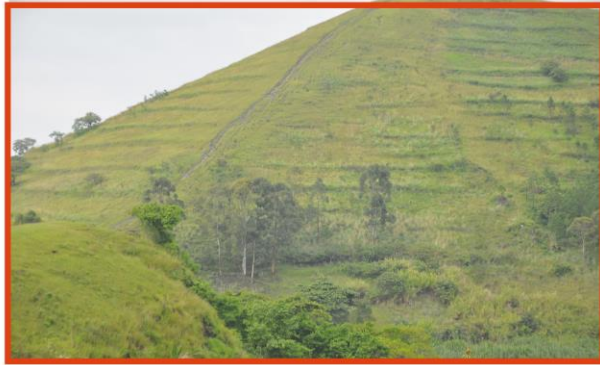
Children not seen in picture prepare to hike the mountain at Kabarole.