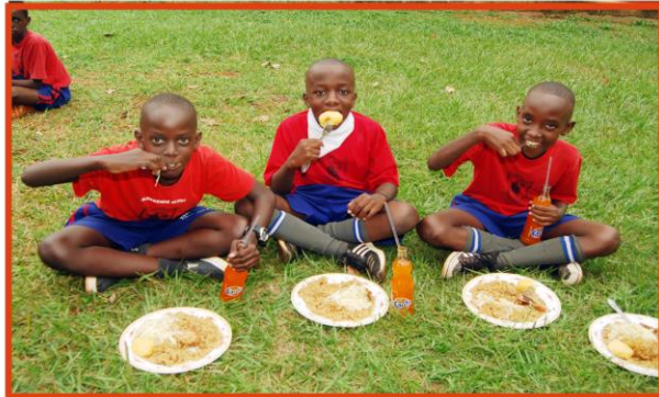
Something mild; pupils were served soft drinks before departure.