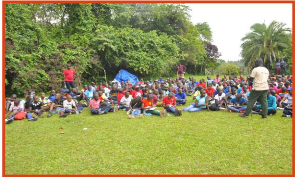
Briefing ahead of Study Tour at Amabere Caves - in Kabarole District Uganda