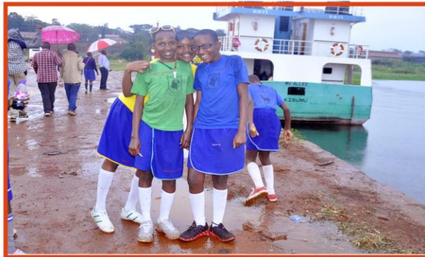
Mother Majeri pupils pose for a photo at Jinja Port (11 08 2017)