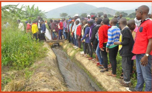
Mother Majeri pupils watching the irrigation channel at Mobuku Irrigation in Kasese District - Uganda