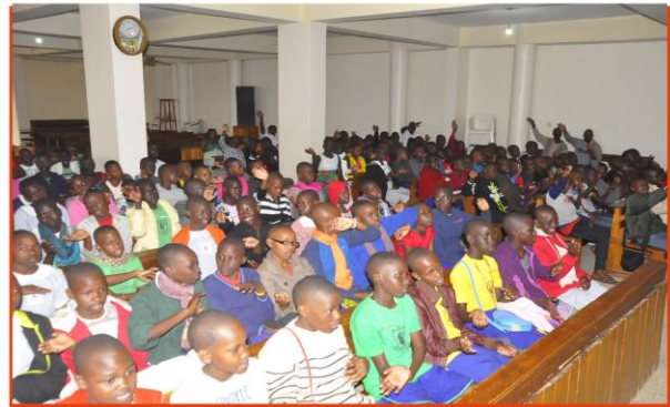
Children attend church service at All Saints church Mbarara as final tour program.