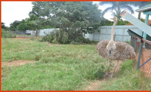
Lonely but alert - The Ostrich above took cover when pupils of Mother Majeri were at the centre on Study Tour.