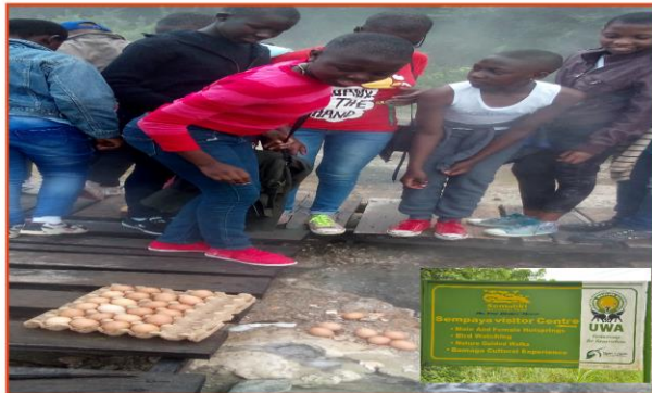
Children boiling eggs at Sempaya Hot Springs in River Semuliki