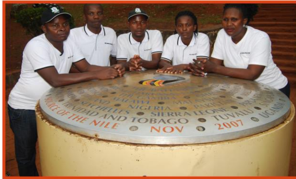
A small section of Mother Majeri staff photographed at the source of the River Nile.