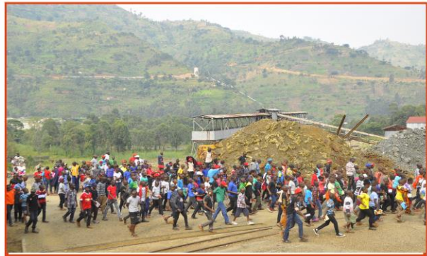
Children visit Kilembe Copper mines in Kasese District