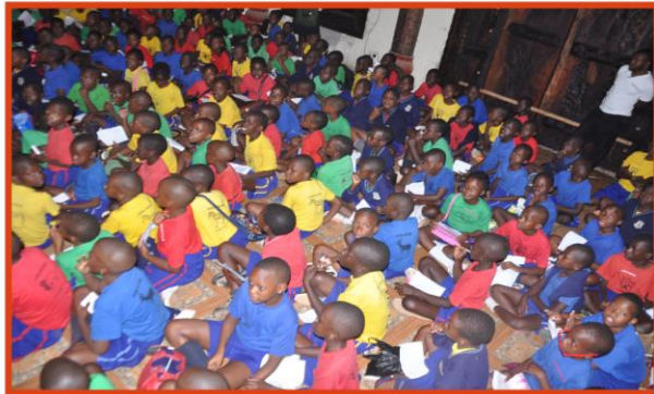
Attentive - Pupils of Mother Majeri during a brief session at Namugongo shrine.