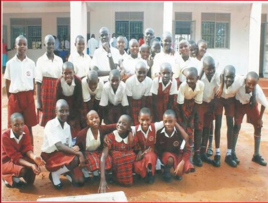
Candidates 2015 - scored 97% first Grade